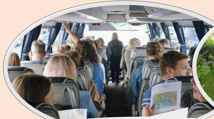
2. Visit to the workshop area