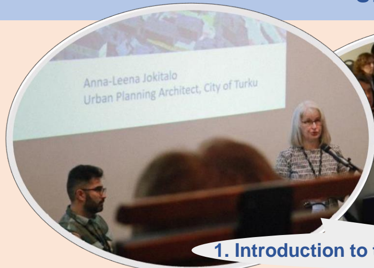
1. Introduction to the host city & inspiring lectures