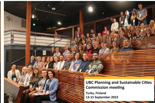
UBC Planning and Sustainable Cities Commission meeting Turku, Finland 13-15 September 2023