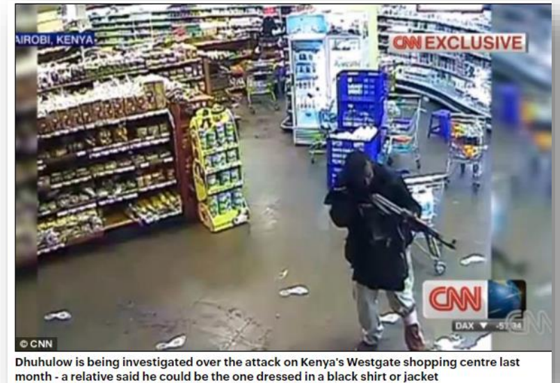
21. september 2013 – Westgate Shopping center, Kenya (63 killed)